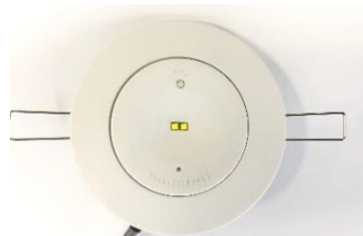
LED Head with Adapter Ring